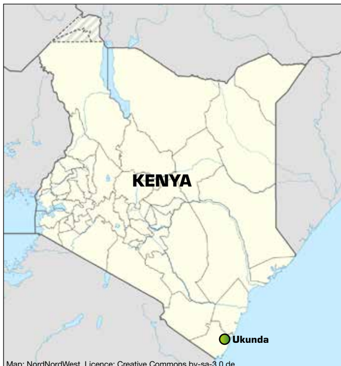
Map: NordNordWest, Licence: Creative Commons by-sa-3.0 de

We decided to pay a visit to some of the Area officials in Diani Location, Ukunda to get their impressions of the projects we have been working on within their locations.