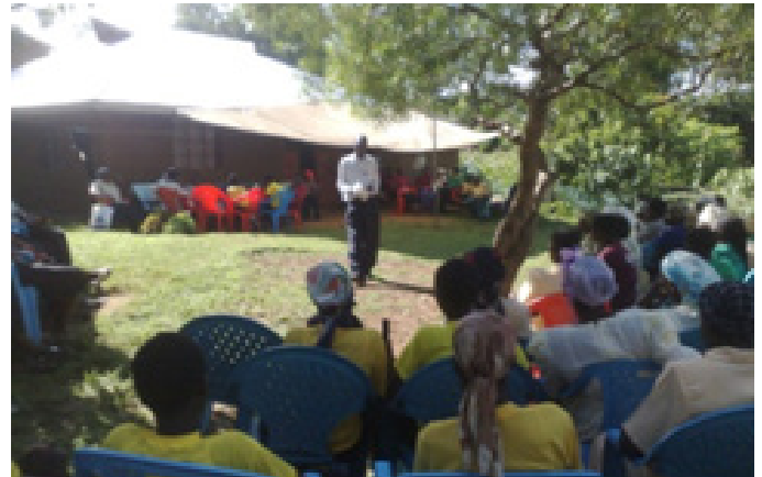
Meeting of the Pawpek Community Based Organisation

The energy efficient stoves from CO2balance are initiating important economic and social activity within the project communities. The reduction in wood fuel relieves pressure on scarce resources and the saving in time and money enables the communities to help themselves out of poverty.