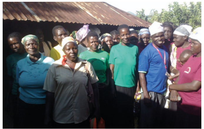
Members of the Pawpek Community Based Organisation

The arrival of the stoves in this area dramatically reduced the burden of wood collection and purchase. This has enabled weekly savings to be made from the reduced requirement for wood fuel and enabled the community to initiate a Village Savings and Loaning (VSL) scheme.