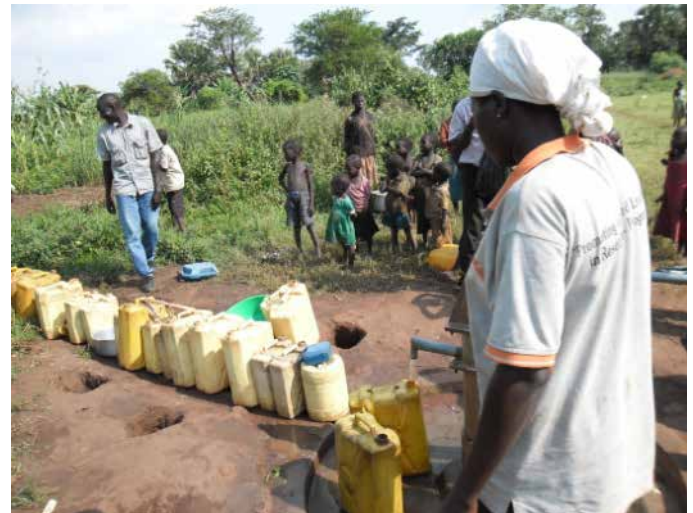
People queue to have access to safe and clean water.

The provision of a safe clean water point close to home has a transformational effect on the lives of people in developing communities, by freeing up time and by reducing the incidence of sickness and disease. The reduced requirement to boil water to make it safe to drink relives pressure on local forestry resources and creates a reduction in carbon emissions.