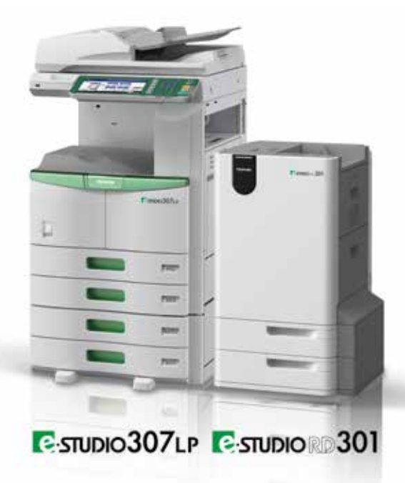
The Toshiba Eco-MFP - revolutionising the way we print. For more information on our eco product portfolio, please visit us at www.eco.toshiba.eu.