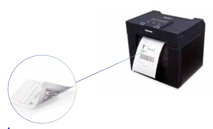
The DB-EA4D saves paper and adds value to your labels.

The three core principles our products and solutions are based on.